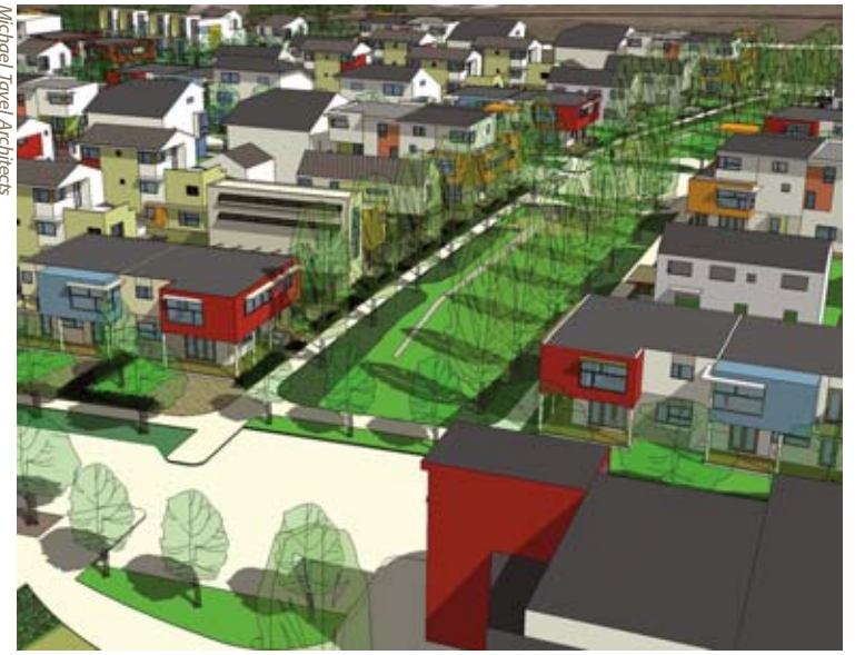
Geos developers plan to leave 40% of the site as green space and protect the 100-year-old trees on the property during construction.

The other huge paradigm shift exemplified by the Geos project is to go beyond zero-energy homes to creating a model for an entire zero-energy mixed-use community. This neighborhood is intelligently planned to achieve a balance between the goals of New Urbanism and energy self-sufficiency. The designers have created a blueprint for change that offers a brighter future for Colorado and may even begin to change the world.